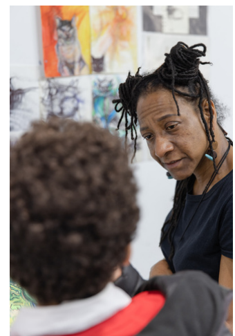
Our artist therapist leads the art drop-in