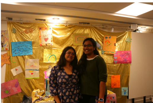
Volunteers, East London Youth Troupe 2025