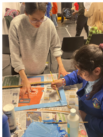
A mentor and child work on set design