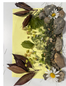
Art drop-in, 2025