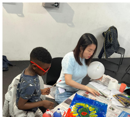
A volunteer and child work on backdrops 2024